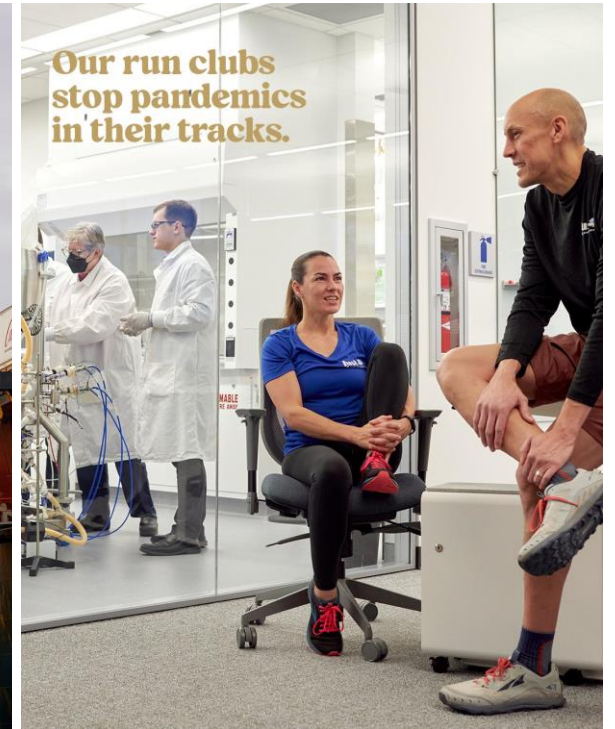
Just Evotech Biologics